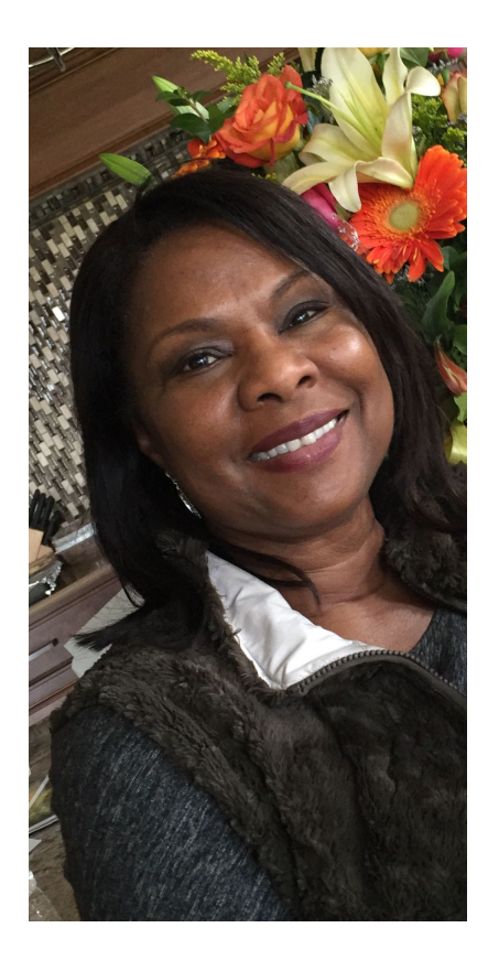
Hello IWF Idaho Members,

Can we talk? I chair the IWF-Idaho Program Committee and I have the opportunity each month to spend an hour or more with some amazing women.