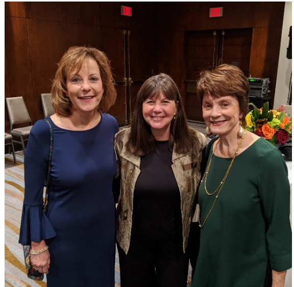
... and the New Mexico IWF Leap into Santa Fe retreat.