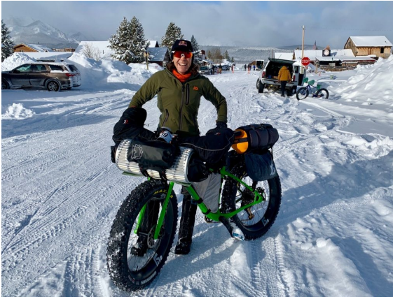
Marin Museum of Bicycling's Mountain Bike Hall of Fame.