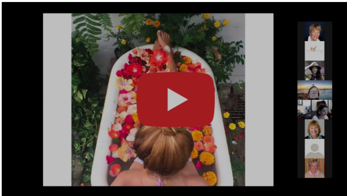
How Water Can Guide Us Towards Deeper Self-Awareness and Enhanced Agility, Balance, and Clarity