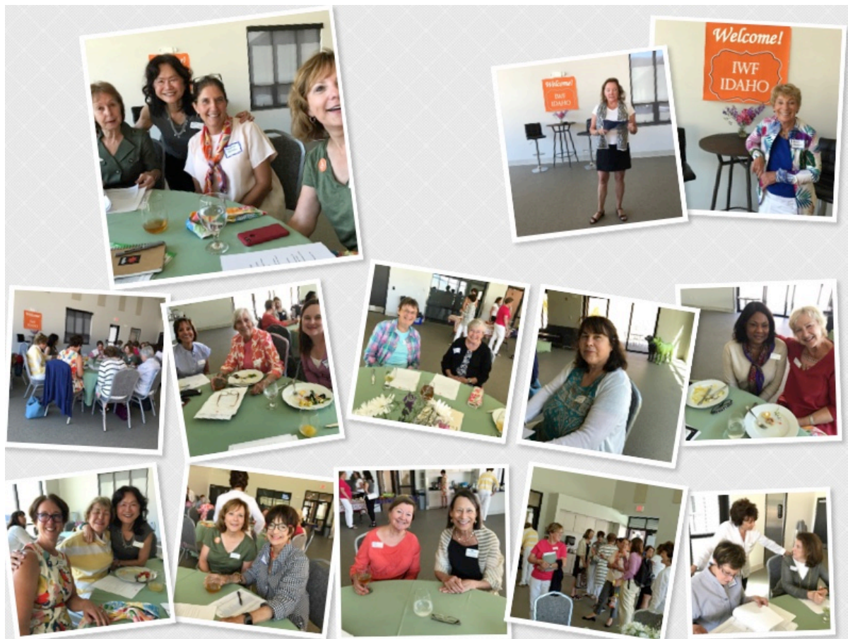
Memories from our last in person Annual Meeting in 2019!